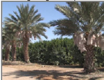
California Fruit Belt