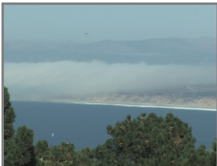
Pacific Coastal Mountains