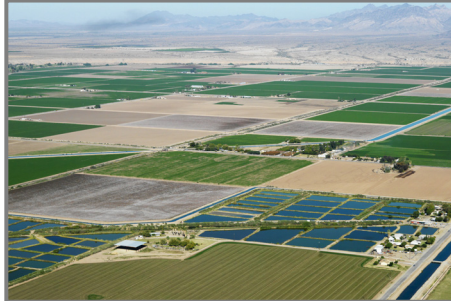
California Central Valley