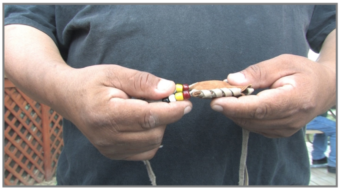
Sioux selling his self-made jewellery

2. Summarize briefly how the Sioux in the film "USA: From the Rocky Mountains to the Pacific Ocean" looks at life on the reservation.