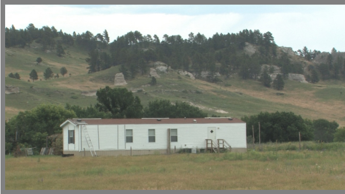
Trailer in a reservation