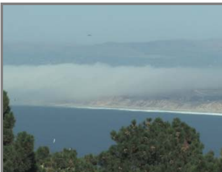
Pacific Coastal Mountains