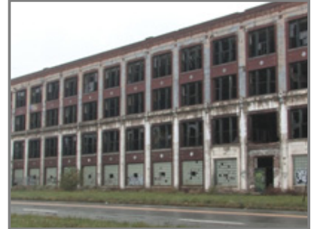
Closed car factory in Detroit

3. In recent years, the Manufacturing Belt has experienced a renaissance. Its decline in significance was at least partly balanced. Explain the changes underneath each picture.