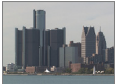
Corporate head office of GM in Detroit