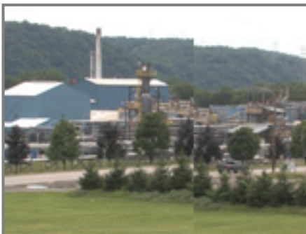
Chemical company in Pittsburgh

3. In recent years, the Manufacturing Belt has experienced a renaissance. Its decline in significance was at least partly balanced. Explain the changes underneath each picture.