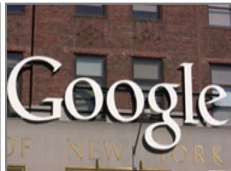
Google office in New York