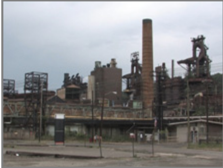
Abandoned steelworks in Pittsburgh

2. Since the 1960s the Manufacturing Belt has been in an economic crisis, shown in the pictures below. The Manufacturing Belt turned into the Rust Belt. Give possible reasons for the decline of each economic sector in the different locations. Write your answers under the pictures.